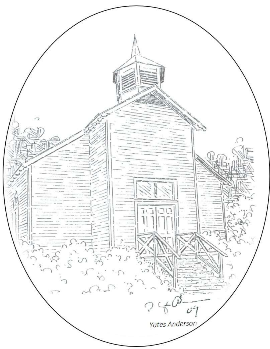
Lake Toxarvay United Methodist Church Sunday, September 17<sup>th</sup>, 2023